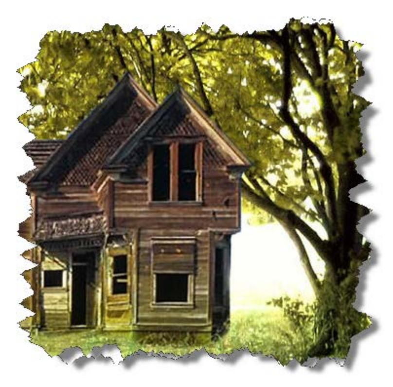
A house in the woods